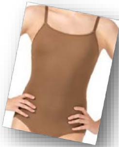
Camisole Leotard with attached bra

In order to ensure that all female students have the proper inconspicuous support for both class and performance, we are recommending the following leotard purchase as well. The undergarments (bras and/or leotards) should be your skin tone, so if any assistance is needed to purchase the proper tone, please inquire.