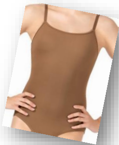
Camisole Leotard with attached bra

In order to ensure that all female students have the proper inconspicuous support for both class and performance, we are recommending the following leotard purchase as well. The undergarments (bras and/or leotards) should be your skin tone, so if any assistance is needed to purchase the proper tone, please inquire.