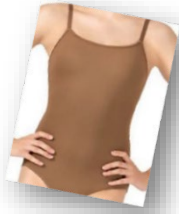
(camisole with attached bra)

To ensure that all female students have the proper inconspicuous support, we are recommending the following leotard purchase as well. The undergarments (bras and/or leotards) should be your skin tone. If any assistance is needed to purchase the proper tone, please inquire.